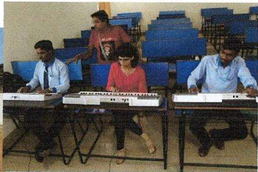
Students attending Hobby Club at GIFT