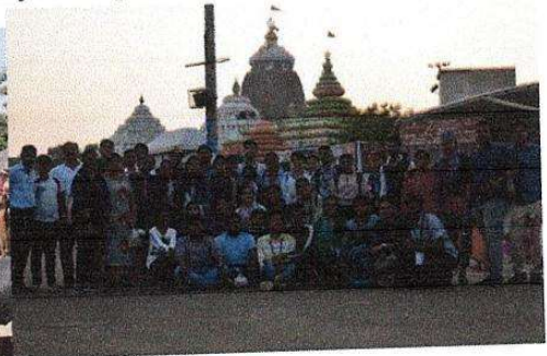
Students visiting to Jagannath Temple, Puri