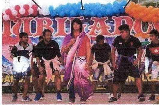
Musical Night of Anand houses