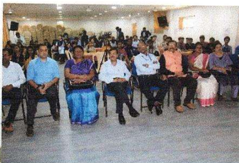
Inaugural function at Conference Hall, GIFT