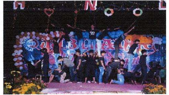
Musical Night of Kalam houses

We have activities under EK BHARAT SRESTH BHARAT program under which we are paired with different colleges of Maharashtra. The students of St. Vincent Pallotti College of Engineering and Technology, Gavsi , Manapur, Wardha Road,Nagpur, visited our college for 5 days, from 17th Feb 2020 to 21 Feb 2020 during which they visited different temples, markets and museum of Orissa at Puri, Konark and Bhubaneswar , to have an idea about our arts and culture. They visited the nearby villages to have an idea about the life style of our villages. They also showcased their culture through Dance, drama and music to our students which was organized at GIFT Campus. This has helped our students to appreciate the culture of Maharashtra. This has helped in promoting tolerance towards Cultural and Regional diversities.