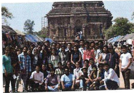
Students visiting to Konark Temple