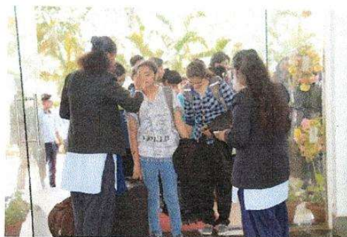
Welcoming the students at the main entrance gate