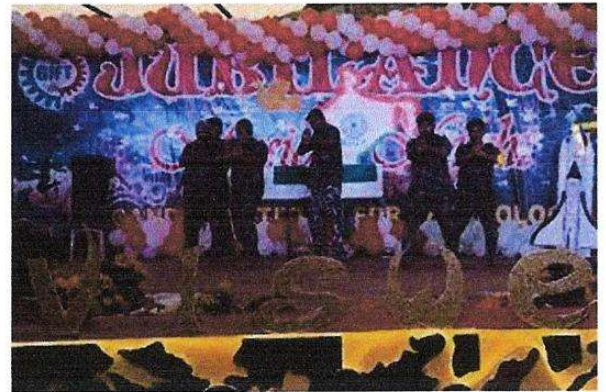
Musical Night of Viswes houses