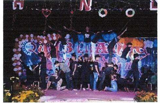
Musical Night of Bhaba houses