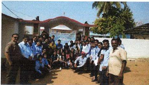
Students visiting to nearby village, Gramadiha