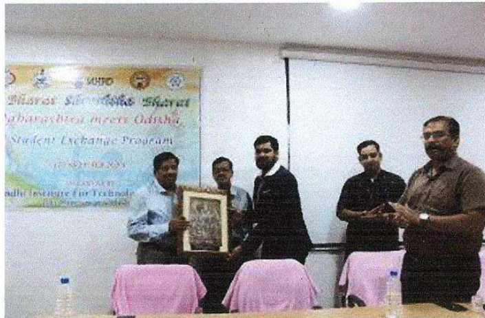
Felicitation of the teachers of St. Vincent Pallotti College of Engineering and Technology at GIFT on 21 st February 2020