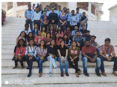
Students visiting to Shanti Stupa, Dhauli