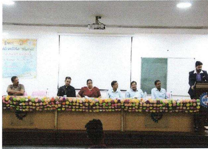
Ek Bharat Shrestha Bharat' held in GIFT