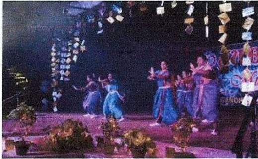
Musical Night of Behera houses