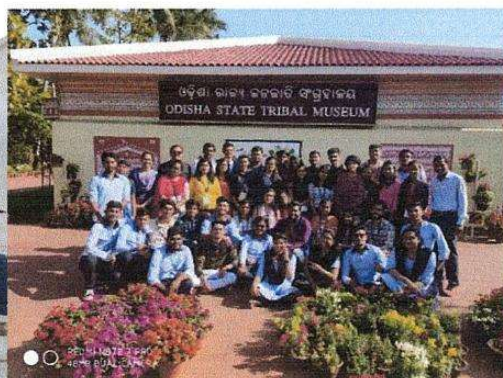
Students visiting to Odisha State Tribal Museum